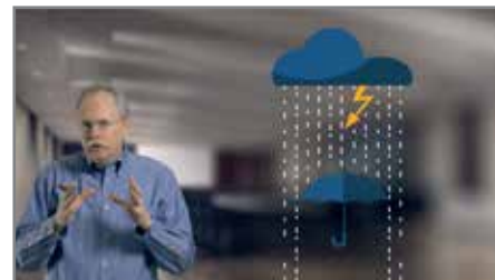
Risk Management In Depth