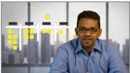
Agile Developer Boot Camp