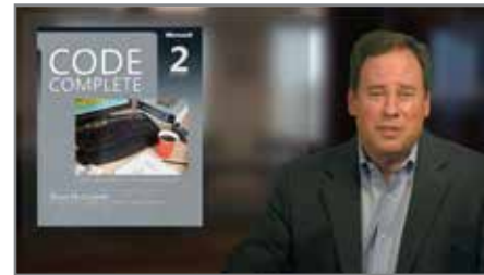
Code Complete Essentials