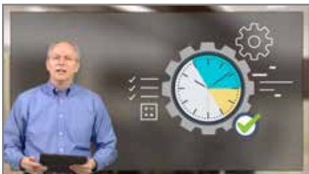
Total Project Quality