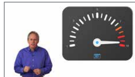
Software Economics Boot Camp