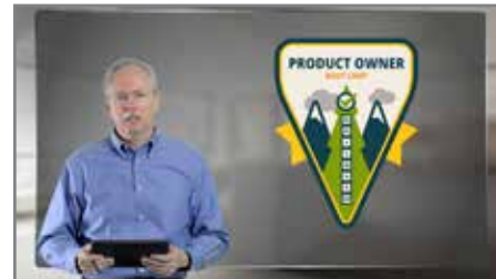
Product Owner Boot Camp