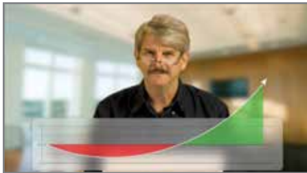
10X Software Engineering