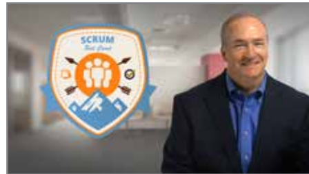
Scrum Boot Camp