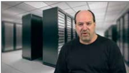
API Design and RESTful Services